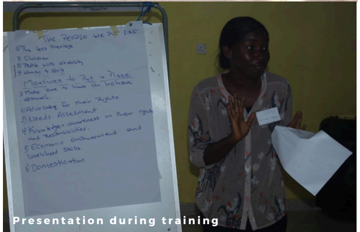
Presentation during training