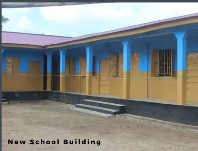
New School Building