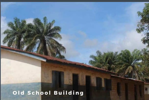
Old School Building