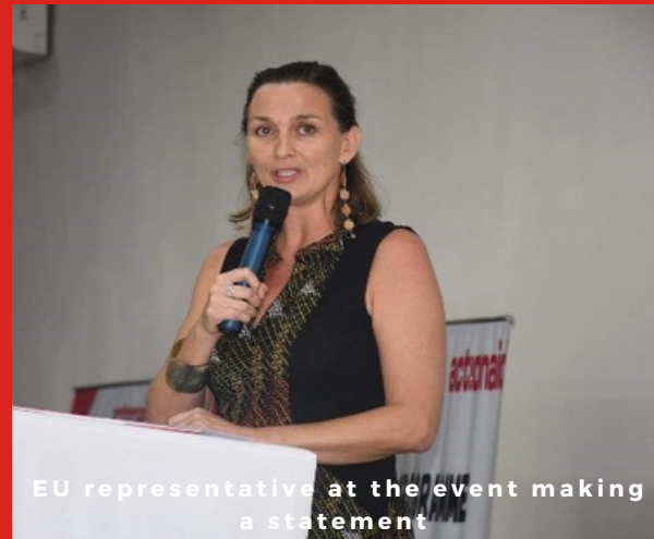
EU representative at the event making a statement