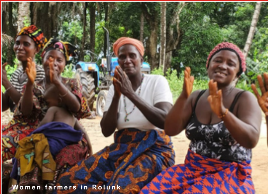
Women farmers in Rolunk

Women in Rolunk Community largely depend on Agriculture as a source of livelihood. As much as farming provides income for them, these women play a pivotal role in producing huge amount of food for their families, community and its environs. ActionAid Sierra Leone in a bid to support women's empowerment and economic development in rural communities provided variety of seeds, a milling machine, livestock, soda for soap-making, facilitated training on soap-making, rehabilitated the Gain store, and other farming input.