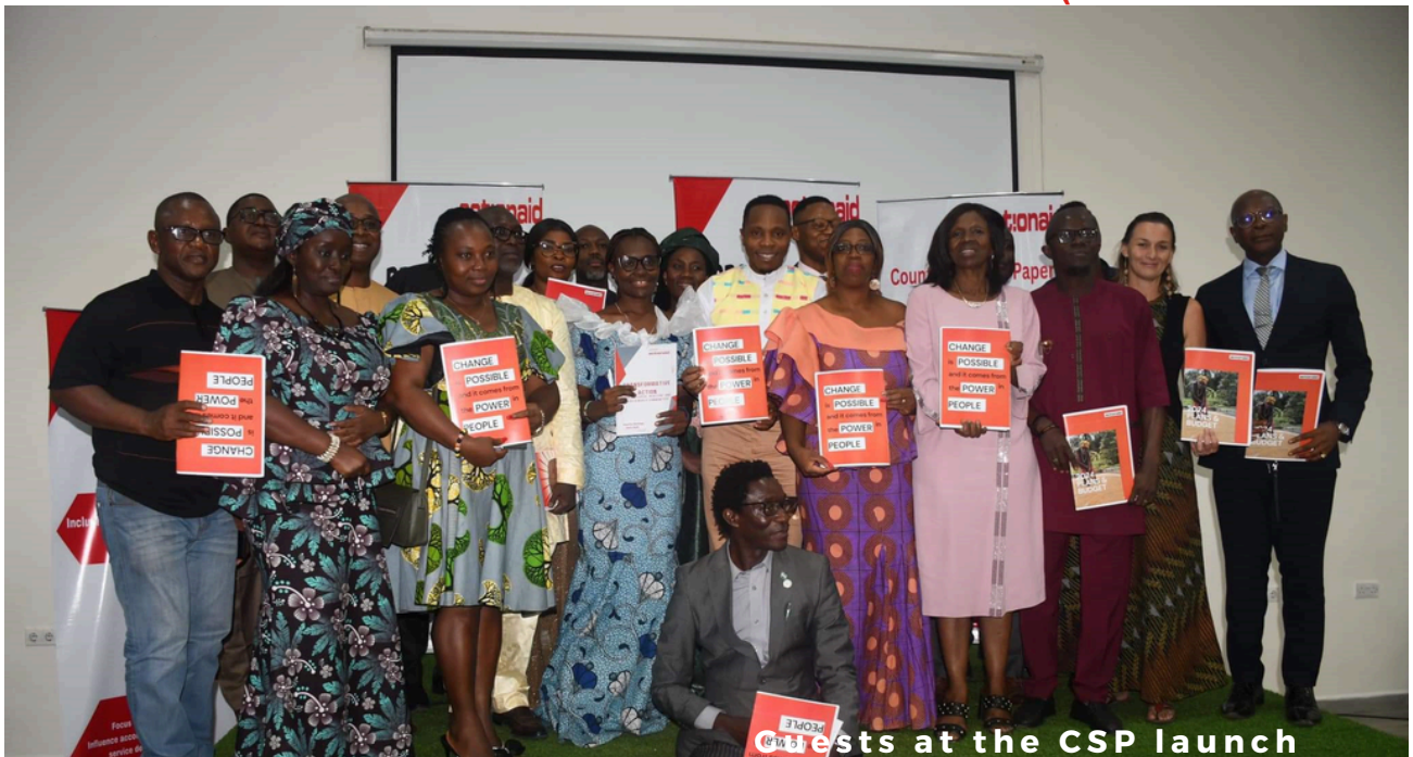
Guests at the CSP launch

The New Country Strategy Paper titled “Transformative Action for Inclusive, Resilient and Sustainable Communities” serves as a roadmap designed to usher in a new era of ActionAid Sierra Leone’s contribution to national development.