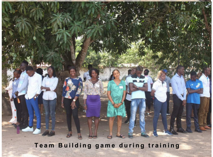
Team Building game during training