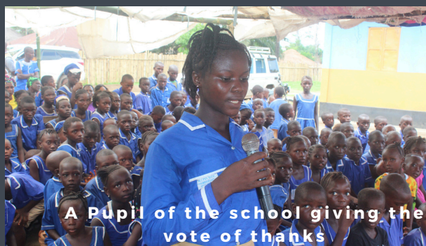
A Pupil of the school giving the vote of thanks

On behalf of the community, the Head Teacher of the United Methodist Church Primary School, assured all that the school is in good hands.