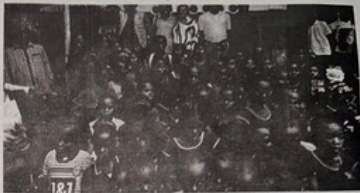
Lady's initiative in promoting equal opportunities for the girl child in Sierra Leone. She urged students to take care of themselves and called on teachers to be vigilant to the needs of their pupils. Through AASL's intervention, the children in these communities now have the privilege to attend school, a crucial step towards their personal and academic development, she remarked.