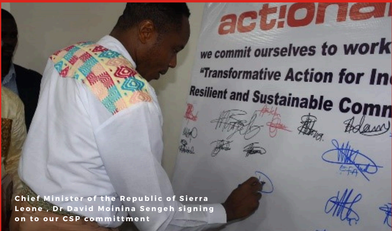
Chief Minister of the Republic of Sierra Leone , Dr David Moinina Sengeh signing on to our CSP committment

In his keynote address, the Chief Minister of the Republic of Sierra Leone, Dr. David Moinina Sengeh said “The key words in the strategy are aligned with our values and principles: Inclusive, Resilient, Sustainable. But the real value and where the impact would come from is in the word ‘Action’, not any action but ‘Transformative Action”.