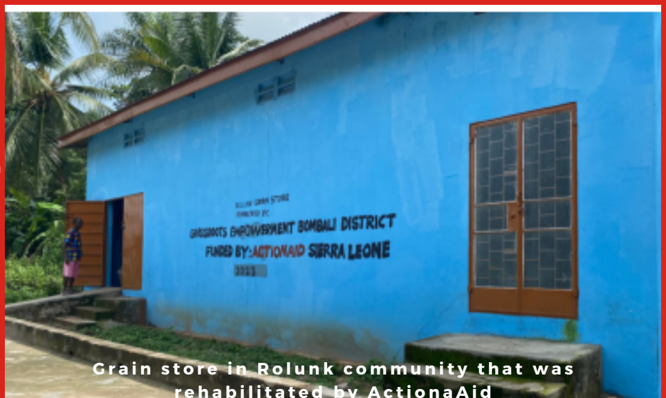
Grain store in Rolunk community that was rehabilitated by ActionAid

"We have seen vast difference in the lives of the women in our community since the intervention of ActionAid in Rolunk. They now actively partner with us to provide the needs of our family and advance community development as required. They contribute to discussions of progress and ensure whatever support we require is given.". Added the Chief of Rolunk Community.