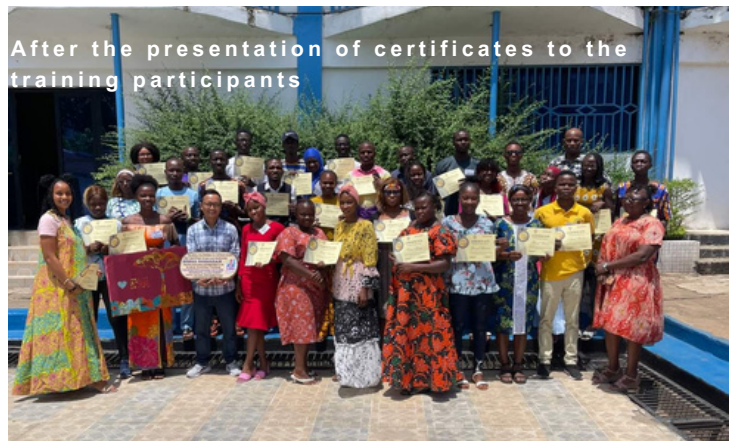
After the presentation of certificates to the training participants

Thirty young people from Bombali participated in the training, which equipped them with the skills to address the issues they are facing.