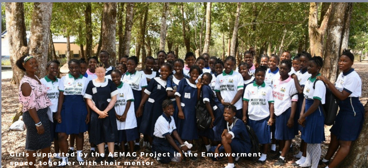
Girls supported by the AEMAG Project in the Empowerment space, together with their mentor

“Action to Empower Marginalized Adolescent Girls” project funded by players of People’s Postcode Lottery has been implemented in two phases for over two years in Sierra Leone, geared towards the empowerment of marginalized adolescent girls both in and out of school. The project supports the education of girls in Western Area and Bo district in Sierra Leone. It also perfectly resonates with the Government’s “Free Quality School Education” program and the “Radical Inclusion Policy”, which creates a platform for girls to access education regardless of their circumstances.