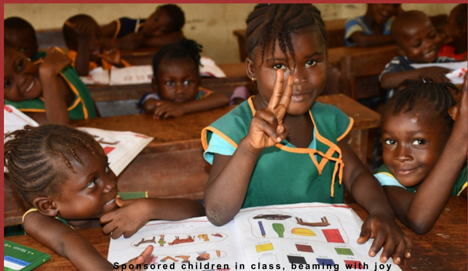
Sponsored children in class, beaming with joy

“I am very proud to be an ActionAid sponsored child especially when I am in class with my classmates because my school bag is always customised with ActionAid logo. Also, sometime last year, my sponsor sent me a post-card and 2 photos which I showed all my classmates and friends in school and at home”.