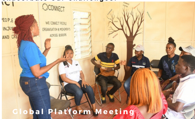
Global Platform Meeting

"We need policies that empower young people," she asserted, "not ones that exacerbate our challenges."